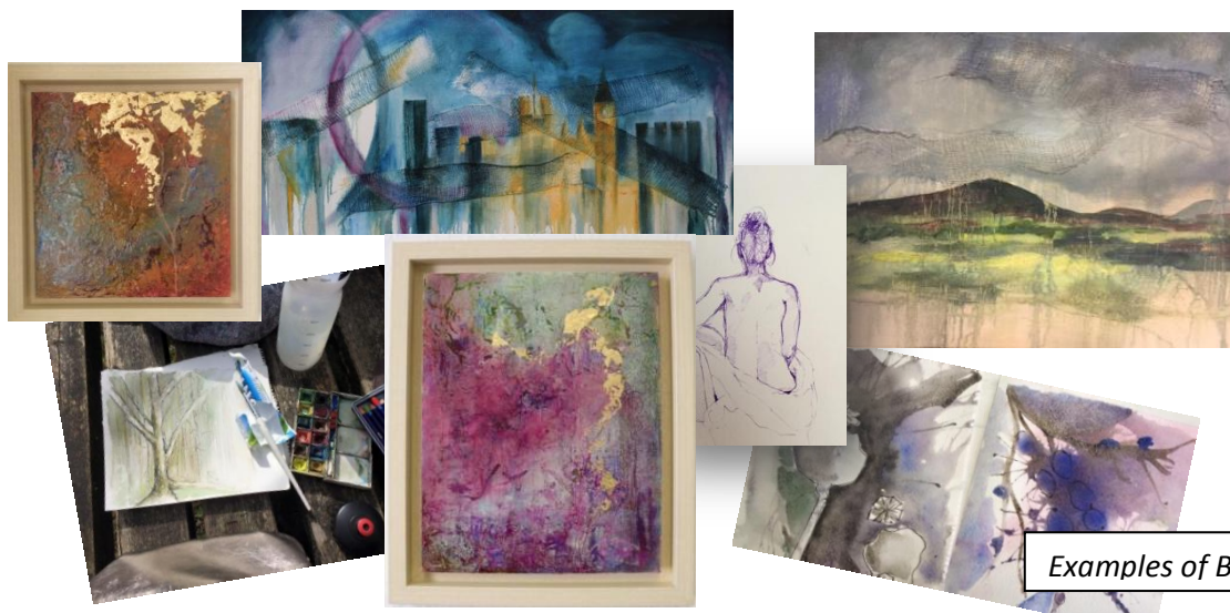
Examples of Beverley's work

The Harbour Hospital – Blackpool Chelsea Flower Show – London The Surreal Vintage Project - London